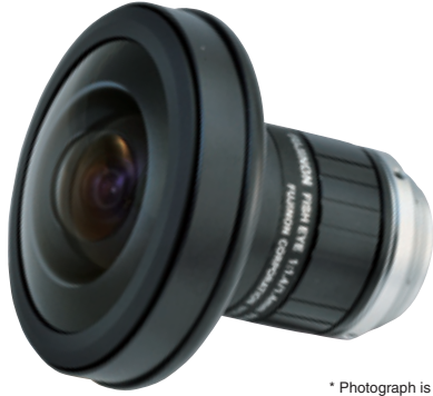
* Photograph is a similar model.

Applicable camera (model) 1 2/3 1/2 1/3 1/4 For Security