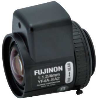
* Photograph is a similar model.