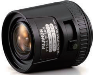
* Photograph is a similar model.