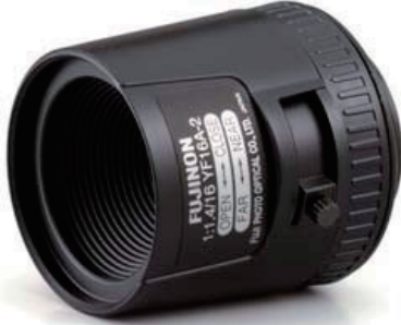
* Photograph is a similar model.