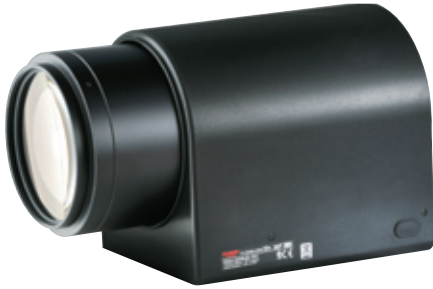
* Photograph is a similar model.

32x Applicable camera (model) 1 2/3 1/2 1/3 1/4 For Surveillance