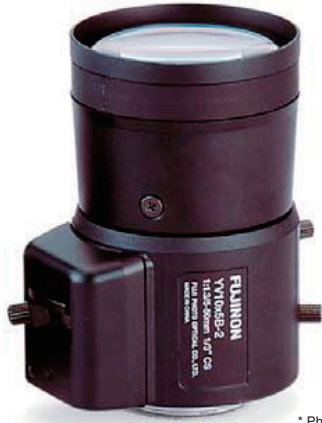
* Photograph is a similar model.

10x Applicable camera (mode) 1 2/3 1/2 1/3 1/4 For Security