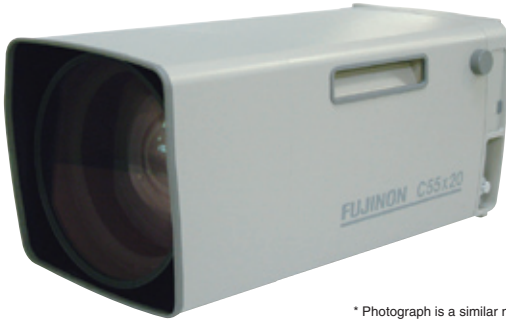
* Photograph is a similar model.