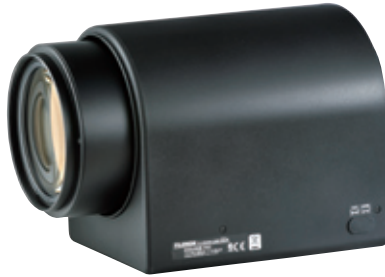
* Photograph is a similar model.

22x Applicable camera (model) 1 2/3 1/2 1/3 1/4 For Surveillance