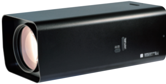
* Photograph is a similar model.